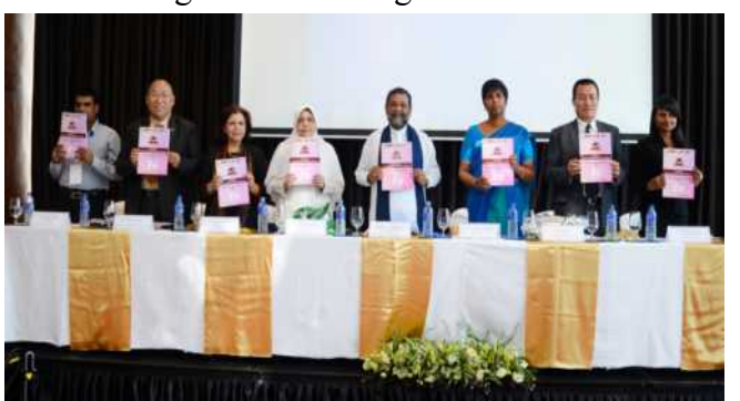
in Colombo, Sri Lanka on 5th December 2014.

Co-oinciding with the Inaugural of SAIEVAC's 4th Technical Consultation on "Stepping"